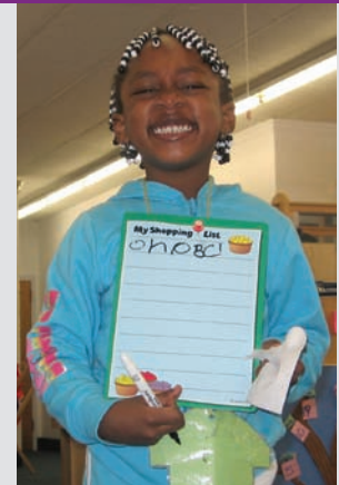
Good Schools for All: Read to Succeed

* Bethel Head Start is a child development program for three to five year olds which collaborates with Good Schools and the Buffalo Board of Education Universal Pre-K to prepare children from low-income households for kindergarten by promoting necessary language and early reading skills.